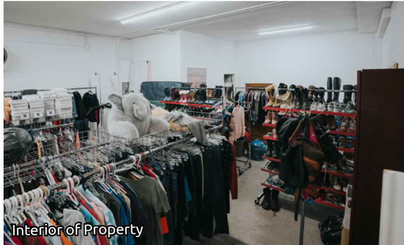
Interior of Property