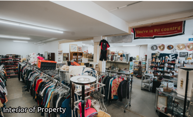
Interior of Property