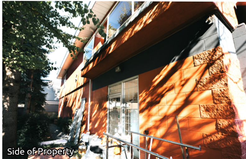
Side of Property