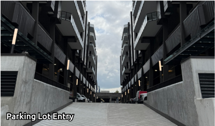
Parking Lot Entry