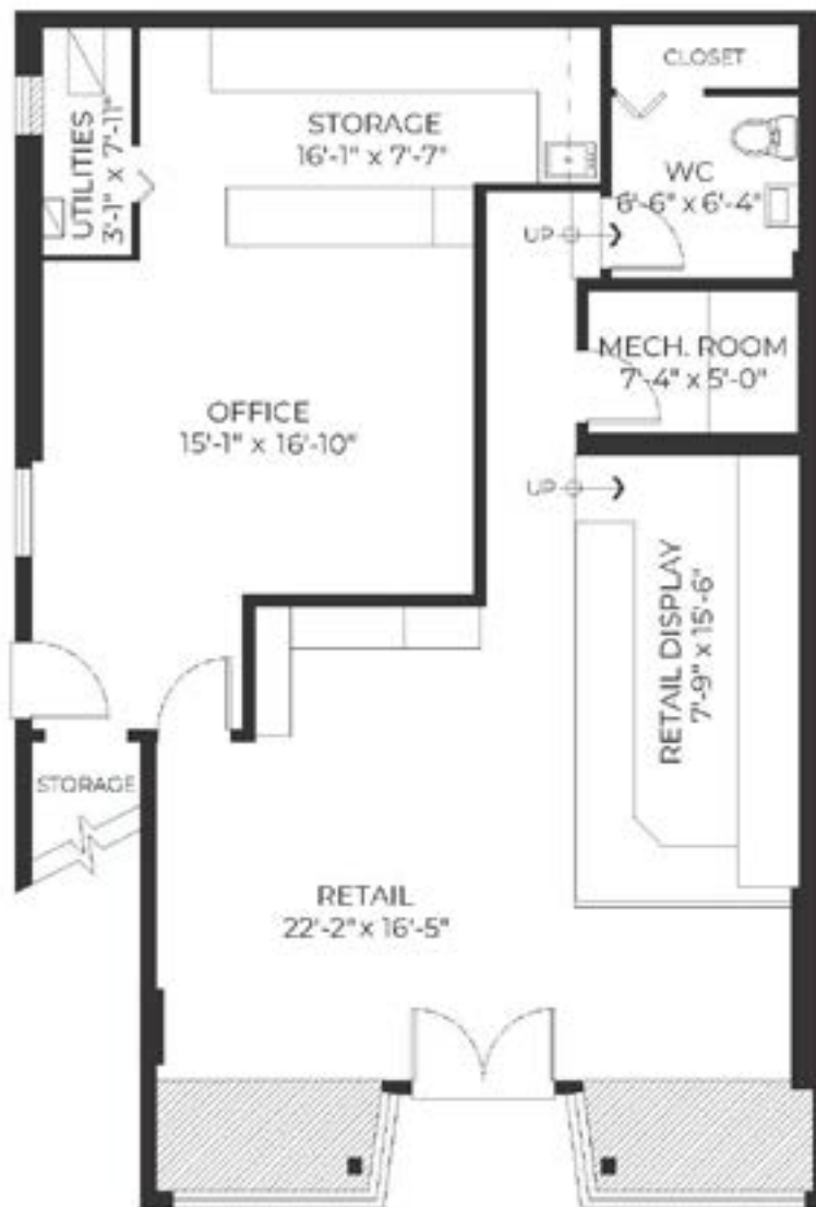
MAIN FLOOR PLAN Ceiling Height: 9'-8"