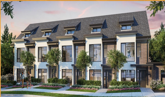
THE OAK | MODERN VINTAGE TOWNHOUSE VANCOUVER BC

*Disclaimer: The drawings provided are artistic representations. The actual size and quantity of units may vary. If deemed necessary feasibility is to be confirmed by the purchaser