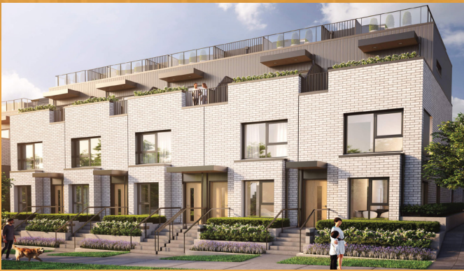
GRACE WESTSIDE | LUXURY MODERN TOWNHOUSE VANCOUVER BC

Kelvin Luk* Principal 604.808.8192 kelvin@lukrealestategroup.com