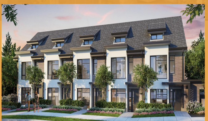
THE OAK | MODERN VINTAGE TOWNHOUSE VANCOUVER BC