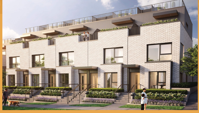
GRACE WESTSIDE | LUXURY MODERN TOWNHOUSE VANCOUVER BC

Kelvin Luk* Principal 604.808.8192 kelvin@lukrealestategroup.com