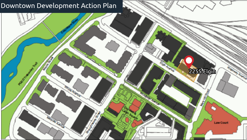
Downtown Development Action Plan

Currently zoned Community Commercial (CC) and within the Downtown Commercial Development Action Plan, the development site at 2245 McAllister Avenue serves as an excellent precedent for the redevelopment potential of underlying land of 2255 Elgin Avenue. 2245 McAllister Avenue has a land size of approximately 33,130 SF. Approved on July 14, 2020, Quarry Rock Development is permitted to build a 5-storey mixed-use building with commercial at grade and residential apartments above. The permitted density is 1.66 FAR.